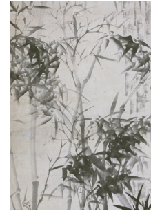
Misty Bamboo on a Distant Mountain (detail)

by Zheng Xie (in the Metropolitan Museum of Art's collection)