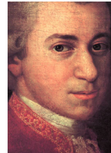
Wolfgang Amadé Mozart

by Zheng Xie (in the Metropolitan Museum of Art's collection)