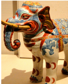
Example of Kakiemon porcelain