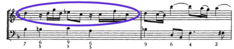
Corelli: Violin Sonata in G Minor, Op. 5, No. 5, Adagio (1700)