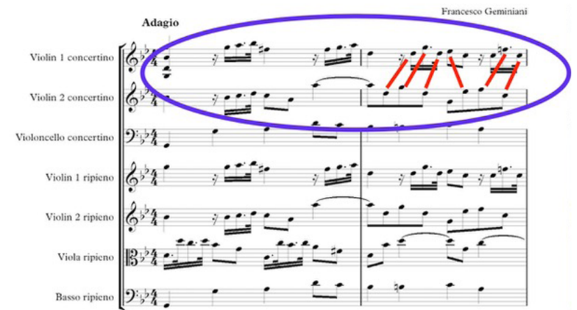
Geminiani: Concerto grosso in G Minor after Corelli Op. 5, No. 5, Adagio (1726)