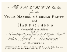
Cover of a manuscript by Charles Ignatius Sancho