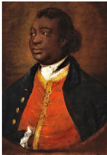
Charles Ignatius Sancho