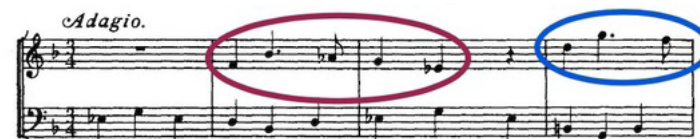
Corelli: Violin Sonata in G Minor, Op. 5, No. 5, Adagio

In the second Adagio, Geminiani initially sets Corelli's single violin line as a conversation between the first and second violins.