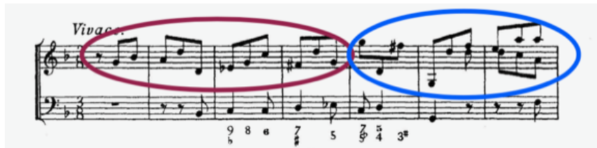
Corelli: Violin Sonata in G Minor, Op. 5, No. 5, Vivace (1700)

In the Vivace, Corelli's single violin line is slightly altered and then shared between the first and second two violins, highlighting the imitative texture.