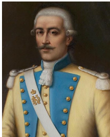
Gaspar de Portolà Portrait from Parador de Turismo de Artes