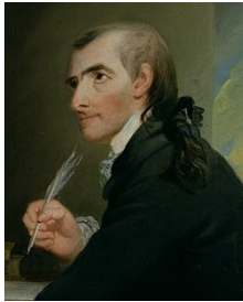
Francis Hopkinson Portrait by Robert Edge Pine