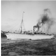
RMS Empress of China Photograph from the Vancouver Archive, 1904