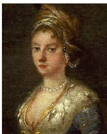
Lady Mary Wortley Montagu