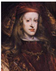
Charles II of Spain