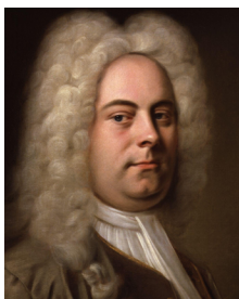
George Frideric Handel