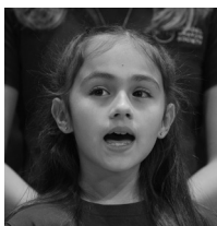
New Voices Grades 2-4

We welcome singers of all ages to join us in January!