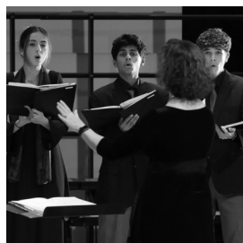
Chamber Choir Grades 9-12