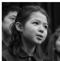
Treble Chorus Grades 4-6